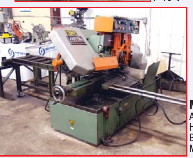
MEGA AUTOMATIC HORIZONTAL BANDSAW, MODEL B5250A