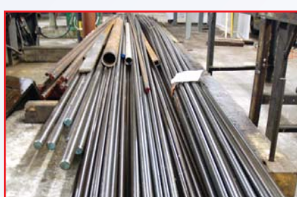
PARTIAL VIEW OF STEEL RAW MATERIAL

Storage Transport Trailer With Aluminum Decking, MICROVU Model 500 HP, 12" Optical Comparator, Precision Inspection Micrometers, Verniers, Tool Boxes, Small Bench Top Shadow Graph Wrenches, Letter Sets, Clamps, Drill Bits, Reamers, Cutters, (12) Makita & Craftsman Belt Sanders, Milwaukee Mag Drill, Angle Grinders, Dewalt Chop Saw, 1,000 lb Lifting Magnet, 12" Rotary Table, Ladders, 15' Jib Boom - 2,000 lb Capacity, Large Selection of Steel Raw Material, Scrap Metal, TRINCO Sandblast Cabinet, Lockers and More.