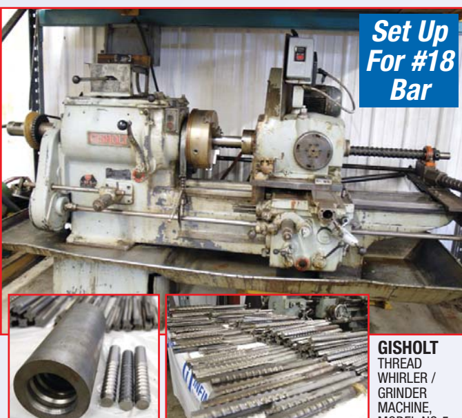
MODEL NO 5