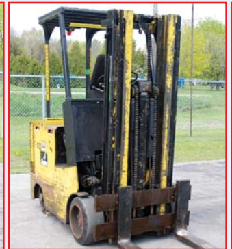
YALE 3,000 LB CAP. ELECTRIC FORKLIFTS, MODEL ERC 050G36T083