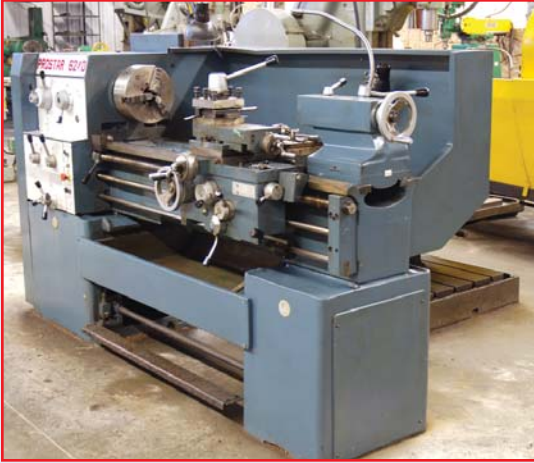
PROSTAR LATHE, MODEL 6240, 16"X40"