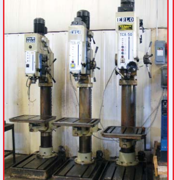
ERLO GEARED HEAD DRILLS, MODEL TCA 35, 45 &50, HEAVY DUTY, AUTOMATIC FEED