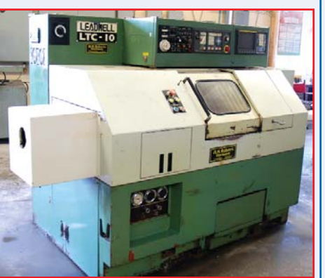
LEADWELL MODEL LTC-10

This brochure is only a partial listing. Please visit our websites at www.infassets.com for more detailed listings and photos.