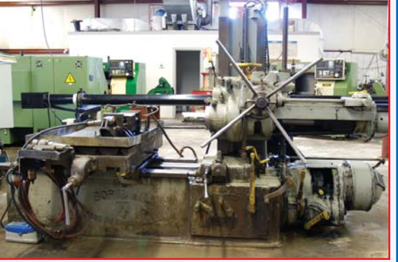
GIDDINGS & LEWIS BORING MILL, MODEL NO. 32