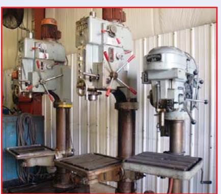
ERLO GEARED HEAD DRILLS, MODEL TCA 50/60, HEAVY DUTY, AUTOMATIC FEED