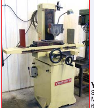
YUNNAN SURFACE GRINDER, MODEL 2MTW, 6" X 18'