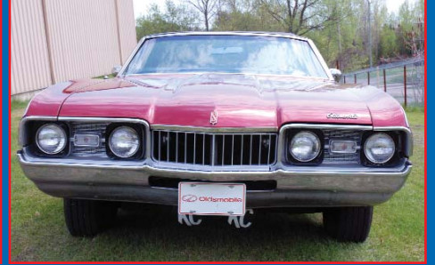
CLASSIC CAR 1968 OLDSMOBILE Cutlass Convertible, 350 Rocket Engine, Ram Rod 350 Ram Air Breather