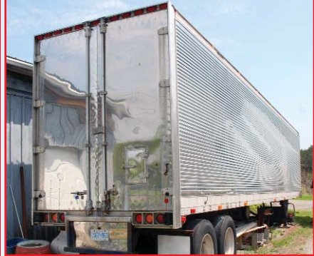
STORAGE TRANSPORT TRAILER