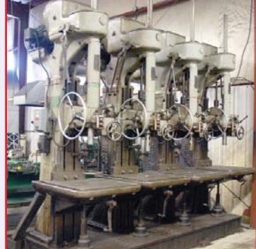
POLLARD & CO 4 SPINDLE IN-LINE DRILL