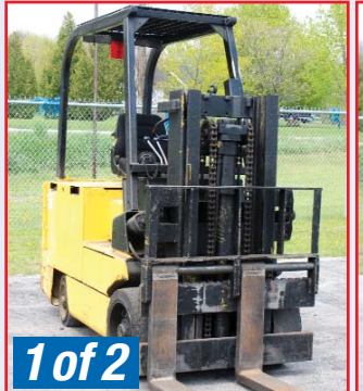
CLARK 8,000 LB CAP. ELECTRIC FORKLIFTS, MODEL EC500.80