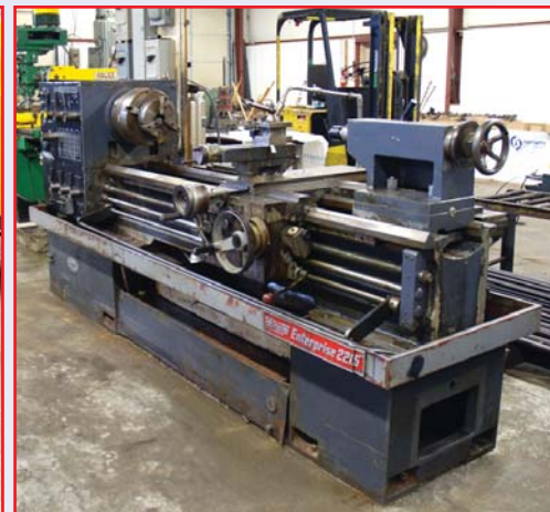
ENTERPRISE LATHE, MODEL 2215, 24"X60"