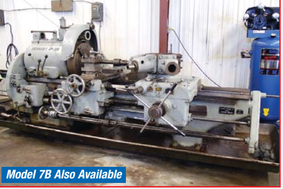
HERBERT TURRET LATHE, MODEL 9B

This brochure is only a partial listing. Please visit our websites at www.infassets.com for more detailed listings and photos.