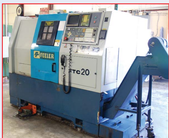
FEELER CNC LATHE. MODEL FTC-20