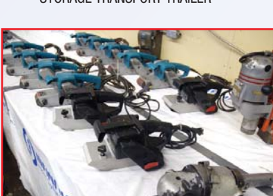
MAKITA & CRAFTSMAN BELT SANDERS