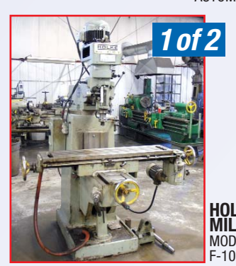
HOLKE MILLS MODEL F-10-V