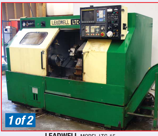
LEADWELL MODEL LTC-15