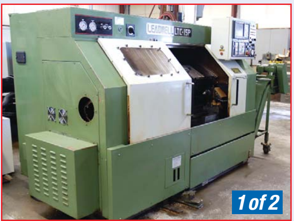
LEADWELL CNC LATHE, MODEL LTC-15P